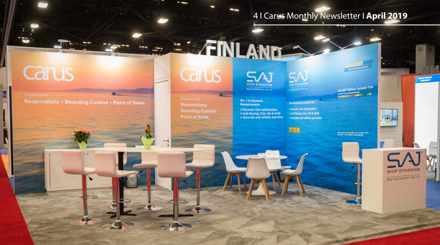
Images of the Carus stand at Seatrade Cruise Global 2019